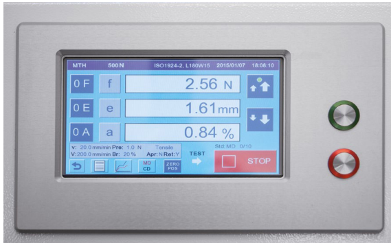
▲ Display of the tensile tester with two separate buttons for Start and Stop.