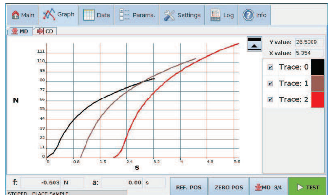
▲ With the device it is possible to preset tests, configure the test parameters, save test results, graphical curves, generate test reports, etc.