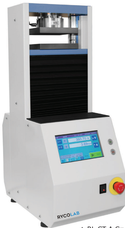
▲ RL-CT-A Crush Tester