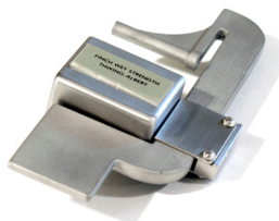
1" Model (731-0040)

Maximum Sample Width 76.2 mm (3 in) Part #731-3000