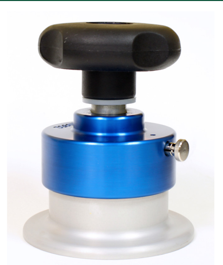
Model PS10 [Cutting Area: 10 cm 2 ]

Specifications subject to change without notice.