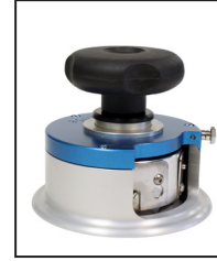
Model PS50 Cutting Area 50 cm 2