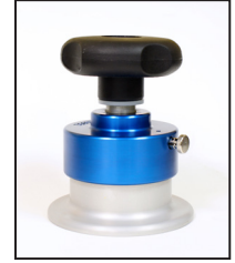
Model PS10 Cutting Area 10 cm 2