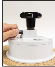
Model 175B Cutting Area 100 cm 2

Specifications subject to change without notice.