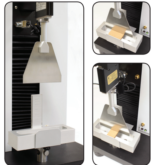
▼ EJA Vantage Fixture Part #1750-3105