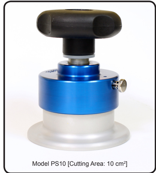
Model PS10 [Cutting Area: 10 cm 2 ]