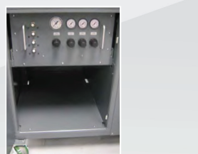
Air Adjustments & Storage Area