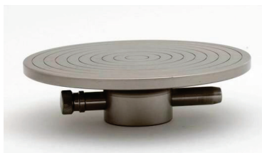
TA23-156-38-Ni: Nickel plated steel platen Temperature range -70°C - +350°C