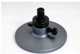
TA23-116-159-AL with additional adapter TAS626-158-158