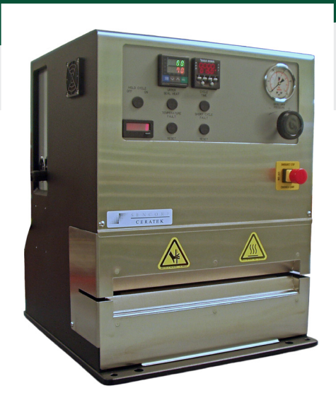
This model offers one flat upper sealing die 1" wide

Consumables Replacement Package is comprised of basic wear items including four (4) upper glass cloth assemblies, two (2) lower glass cloths, one (1) thermocouple and one (1) lower silicone rubber pad.