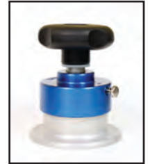
Model PS10 Cutting Area 10 cm 2