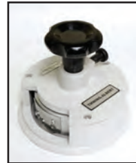
Model 175B Cutting Area 100 cm 2

Specifications subject to change without notice.