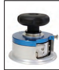
Model PS50 Cutting Area 50 cm 2